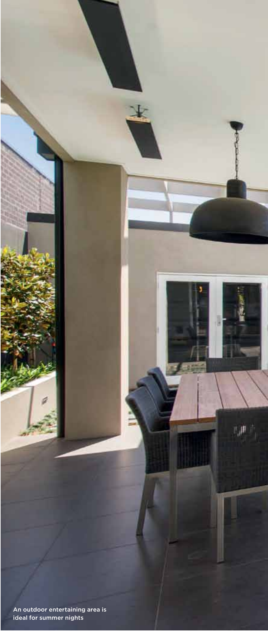
An outdoor entertaining area is ideal for summer nights

The fundamental vision of the renovation was to keep the mature and timeless period details of the existing cottage and blend it